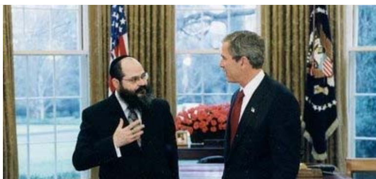
United States of America - President George W. Bush